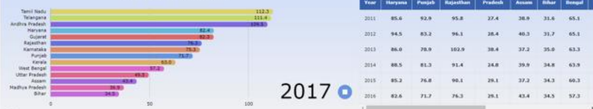
CREDIT DEPOSIT RATIO - SELECT STATES